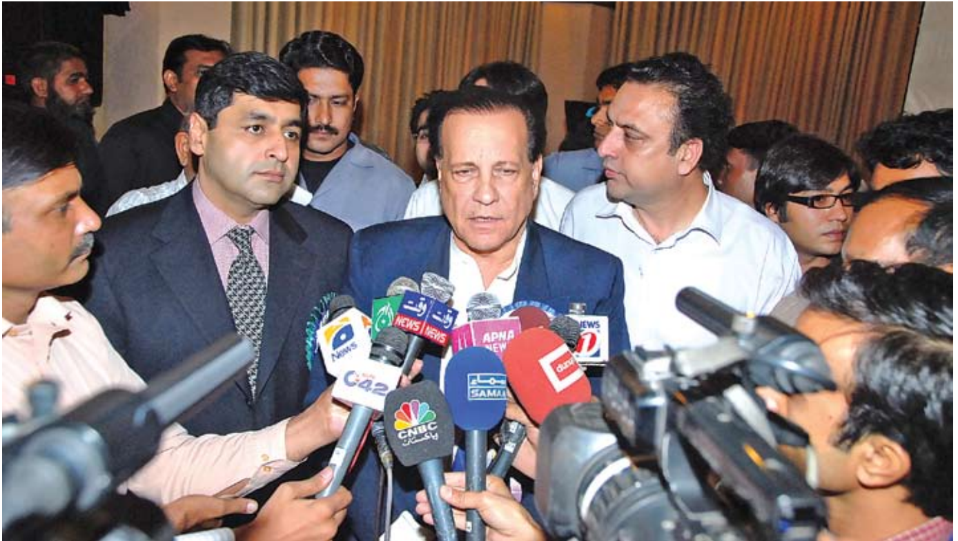
Punjab Governor and media owner Salman Taseer was murdered by his bodyguard because he voiced solidarity and sympathy for a woman sentenced to death under Pakistan's blasphemy law. This photo was taken in Lahore in October 2010.

Pakhtunkhwa and the adjoining tribal areas between April 2010 and 2011 as a result of suicide attacks, other terrorism-related incidents and targeted killing.