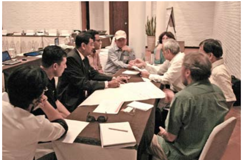
South Asian delegates attending the IFJ Asia-Pacific Regional Meeting in Indonesia in September 2010 stressed the need to keep building cross-border alliances and to conduct joint campaigns to promote and defend journalists' rights across South Asia.

In Nepal, the number of killings of media personnel has dropped since the end of the decade-long civil war in 2006