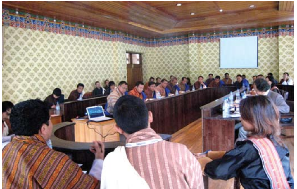
Journalists in Bhutan attend a training program to assist them meet the growing demands of the country's expanding media.

As with the branches of governance, the media also is at the centre-stage of public debates as Bhutan undergoes