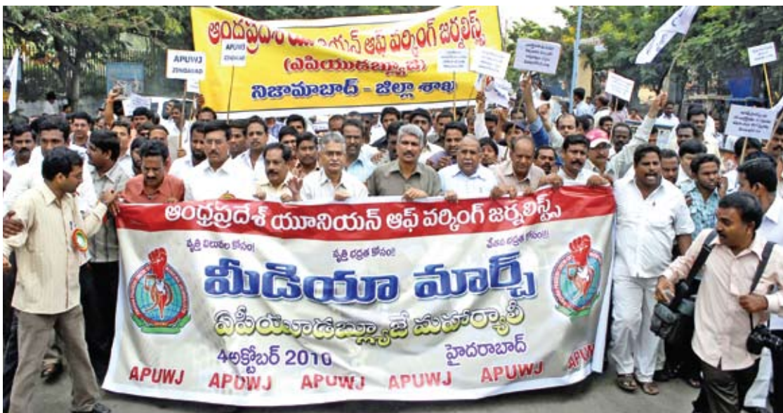
Members of the Andhra Pradesh Union of Working Journalists (APUWJ) protest in Hyderabad in October against the advent of "cash for coverage" in India's media.