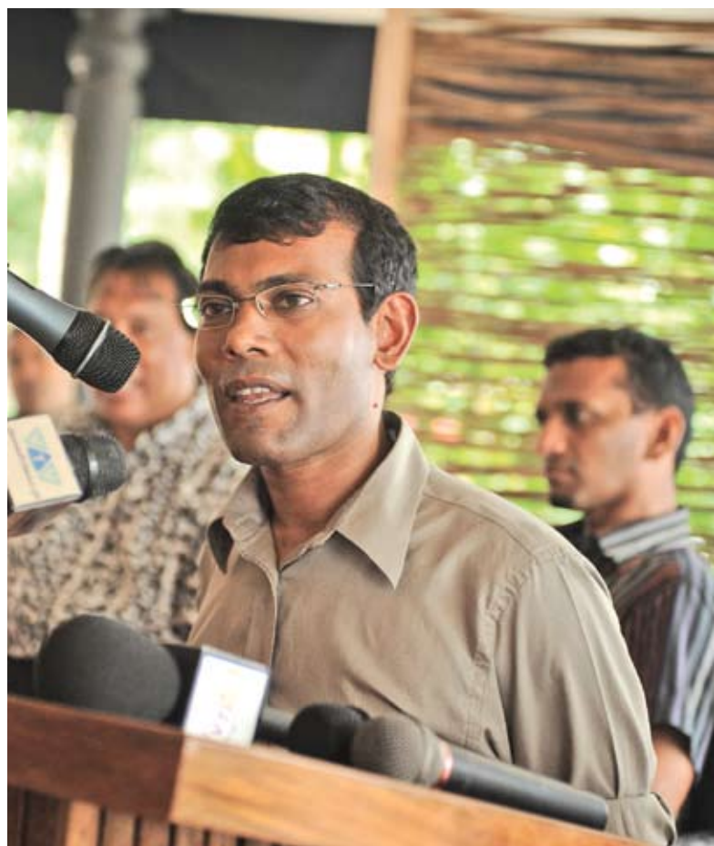
The administration of Maldives President Mohamed Nasheed expressed regret for the actions of police who used excessive force against journalists reporting on a demonstration in October.

In October 2010, Maldives police reacted with excessive force against journalists who were covering a demonstration by the main opposition, the Dhivehi Rayyithunge Party (DRP). According to the MJA the journalists were beaten with batons, some of them shackled and a number briefly detained. Facing strong public criticism, the police came up with the explanation that some of the journalists covering the demonstration had started engaging them in a confrontational spirit. They allegedly refused to stay within the defined zone and failed to comply with police orders. This compelled the police, as they explained, to use force to move the journalists away from the trouble zone.