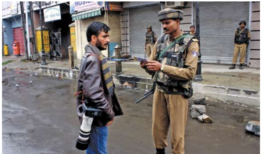
Daily movements for news gatherers in Kashmir have become an ordeal with few security personnel willing to recognise their legitimate role

Newspapers were shut for about 30 days in total between mid-June, when Kashmir’s protests began to intensify, and around the end of September, when they began to wind down. The travails for journalists became particularly grim from 7 July 2010 when, after several years, the Indian army was summoned out of its barracks and deployed on the streets of Kashmir, curfew restrictions were extended to cover the movement of all civilians and an announcement made