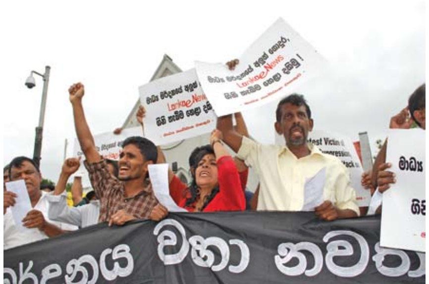
The January arson attack on the Malabe offices of Lanka-e-News spurred calls for a full investigation among press freedom defenders in Colombo.

The office of the news portal Lanka-e-News located in the outskirts of Colombo, was set on fire midnight 31 January, compelling many to dub January as the black month for media freedom in Sri Lanka. Preliminary investigations confirmed that petrol was used to start the fire, which completely consumed the offices of the online publication, including a library of e-news archives and thousands of valuable books. The website has been very critical of both President Mahinda Rajapaksa and his brother Defence Secretary Gotabhaya Rajapaksa. In the week prior to the arson attack it carried detailed reports of Rajapaksa's sudden and secret visit to the United States, which the website reported was for medical purposes. In another report it