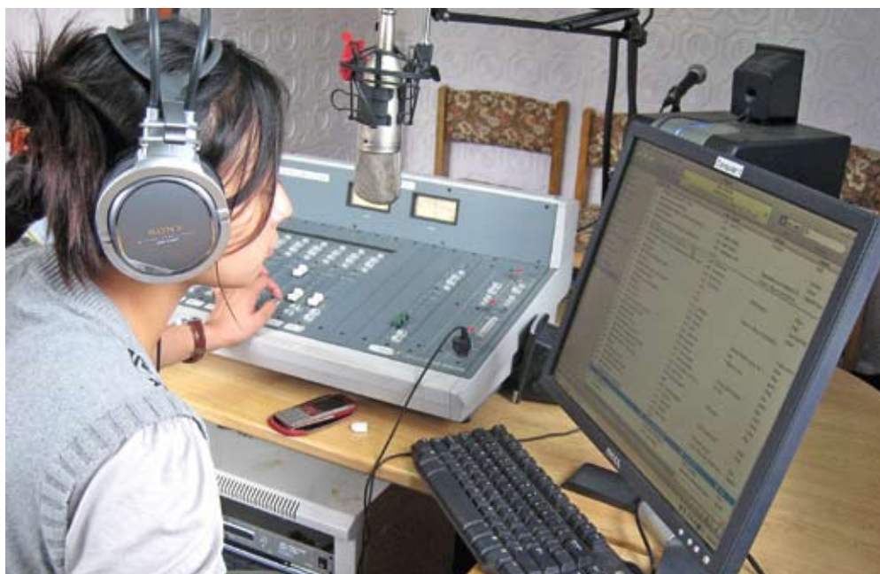
Private FM radio has developed a new argot popular among the youth.

newspaper managers have begun to say that this policy acts as a disincentive to those who work hard to ensure quality while rewarding all newspapers regardless of the quality of content and reach.