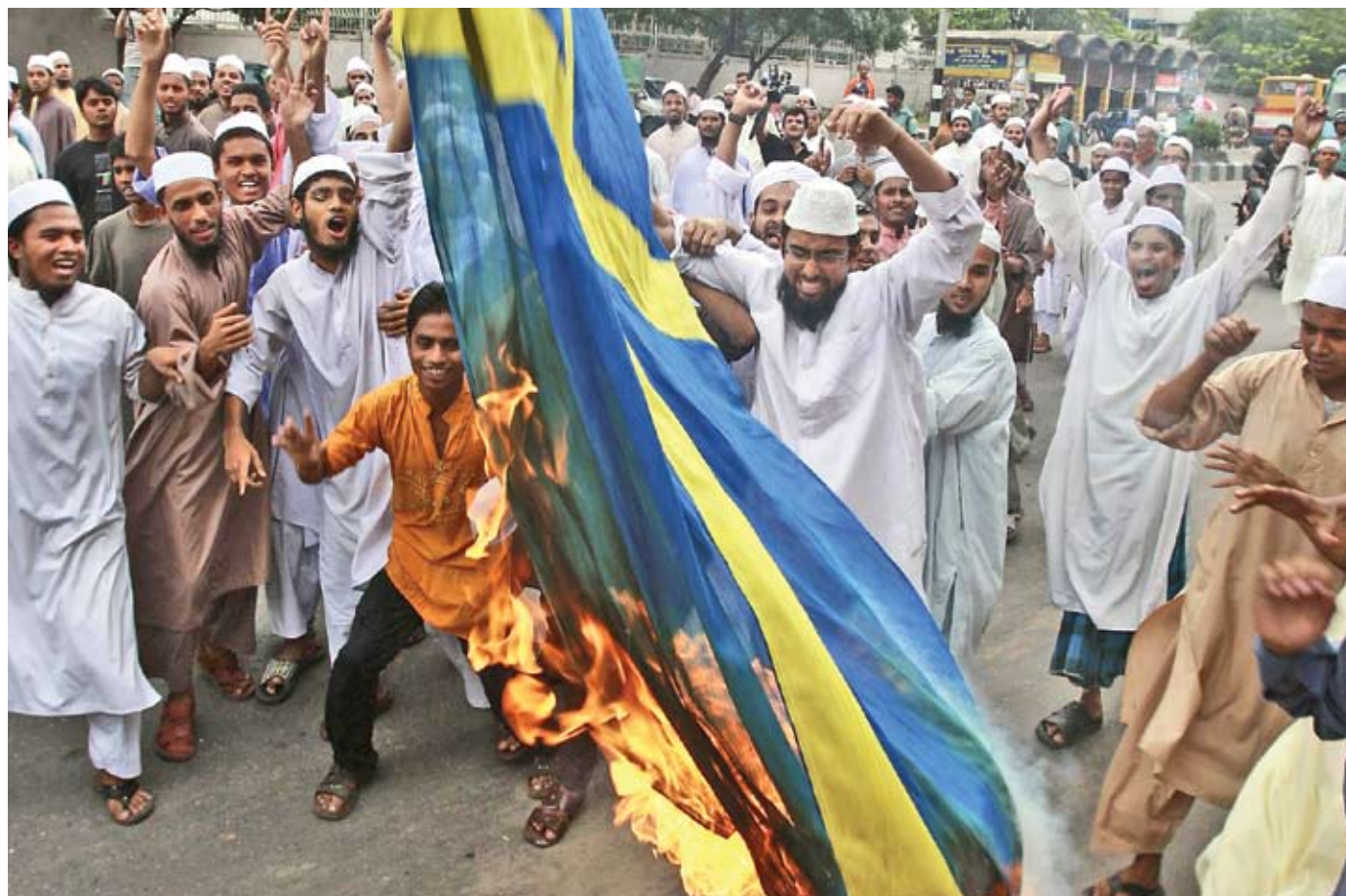
Protestors in Dhaka, Bangladesh react in May 2010 to Facebook's hosting of a competition which featured cartoon drawings of the Prophet Mohammed.

The newspaper had apparently been bought up by Mahmudur Rahman from its erstwhile publisher shortly after Bangladesh returned to civilian rule in 2009. The erstwhile publisher determined in October 2009 that he would discontinue his association with the newspaper and formally notified the local authorities in March 2010. An application that Rahman tendered to be registered as the publisher of Amar Desh was rejected on the grounds that he was ineligible because of numerous criminal cases registered against him. The closure of the newspaper followed the formal receipt of