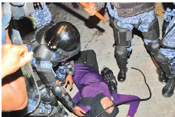
A journalist is knocked to the ground as police resort to heavy tactics during a protest in Male in October 2010.

Corporation (MNBC), were to be handed over to the new body.