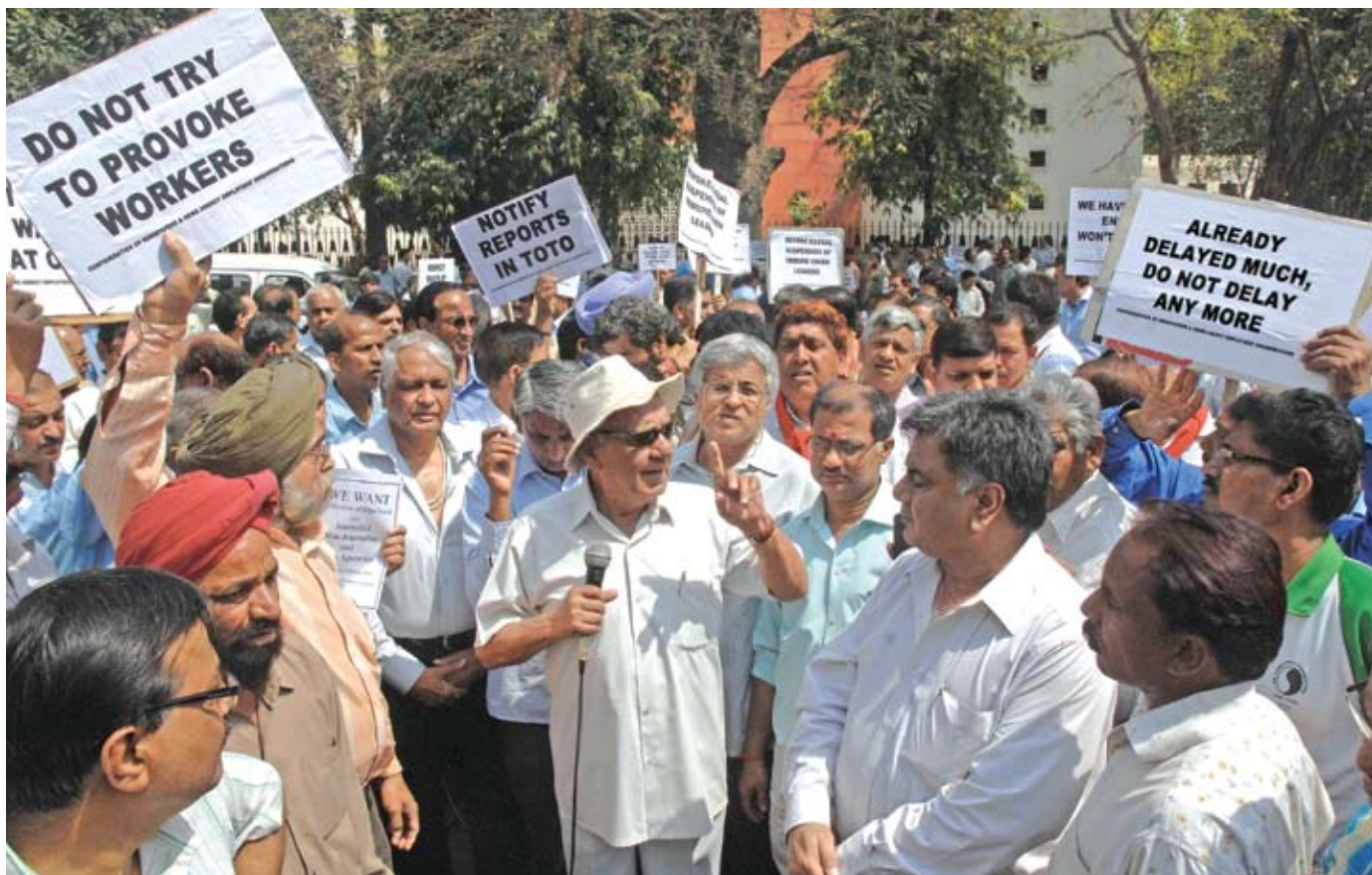
Journalists in Delhi in March 2011 call for action on India's wage award for media workers.

The newspaper industry was reprising a theme used virtually since the first few years of the WJA. When introducing the WJA in Parliament back in 1955 the minister holding the relevant portfolio said that though small in scope, the new law was important since it held possibilities to promote "better security of journalists" which would necessarily promote the freedom of the press. But the very first wage award made under the law was challenged in India's highest court and held unlawful on the ground that