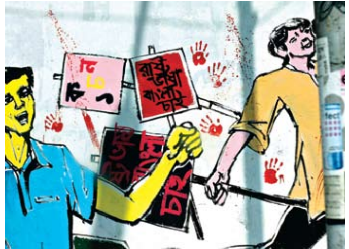
There are hopes that discord over the legacy of the country's freedom struggle could soon cease and a new spirit of unity achieved among journalists.

On the basis of these applications the BTRC has allocated frequencies and granted permission for purchase