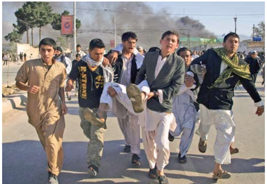
Afghans rush to assist a man wounded in an attack on a UN office in Mazar-i-Sharif on 1 April 2011. The attack, in which seven UN workers and five others were killed, highlights the climate of violence which daily confronts Afghanistan's journalists.

By no means was the Kunar incident an isolated case of