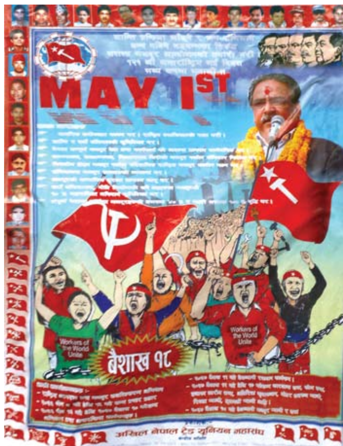
Nepal's Maoists launched a program of agitation against the incumbent government in May 2010 leading to its resignation after street violence in which several journalists were injured

The conduct of the committee constituted to inquire into Joshi's murder has been referred to the Commission for Investigation of the Abuse of Authority, a special body created under the 1991 constitution and expected to function as a vital part of the process of national reconciliation after the Comprehensive Peace Agreement of 2006.