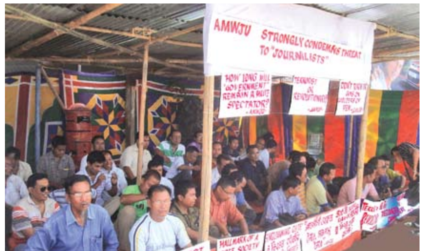
The All Manipur Working Journalists' Union (AMWJU) protests against intimidation of media houses, which caused the temporary closure of local newspapers in October.

Initial complaints by the targeted journalists with local police officials were reportedly met with indifference.