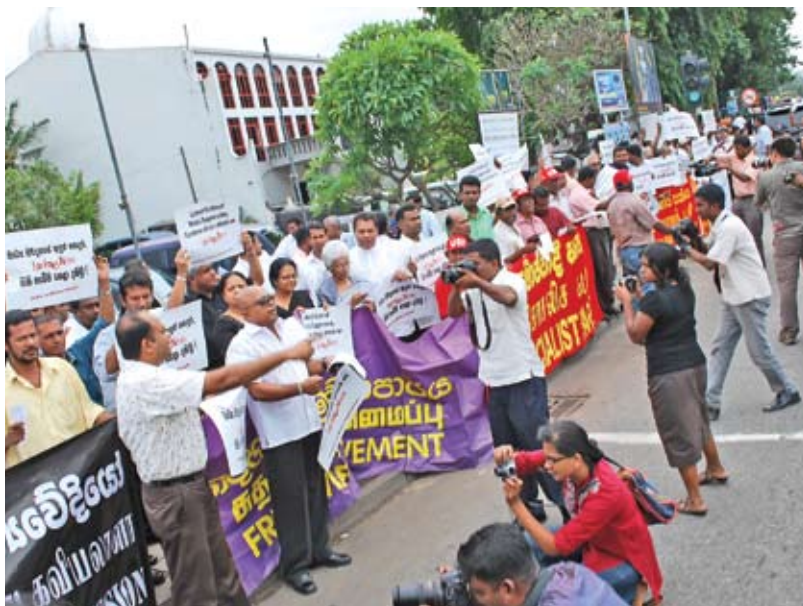
On January 31, arsonists attacked the Lanka-e-News office, near Colombo. The news portal and its journalists, known for their critical reporting, have long suffered targeted violence.

The process of self-censorship has also had its impact on the coverage of proceedings of the Lessons Learned and Reconciliation Commission (LLRC), set up since the end of the civil war as a part of the process of national reconciliation and social justice. Incidents where local and foreign journalists were banned from attending LLRC sessions in the Boosa detention camp received wide publicity. What remained unreported in most media however was the disturbing accounts of the end of the war, even though several journalists from English and Sinhalese-language media have been allowed to follow the LLRC's work. It was once again left to Groundviews