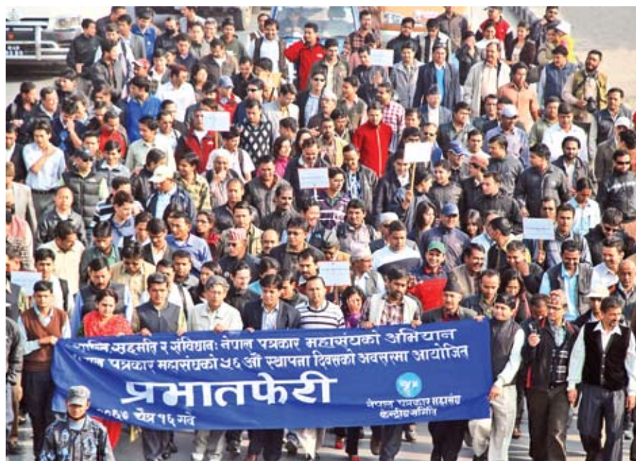
The Federation of Nepali Journalists (FNJ) celebrates its 56th anniversary on 30 March 2011. Representatives who spoke on the day underlined the importance of democracy, human rights and press freedom.

newspaper distribution in sections of the country, according to their publishers.