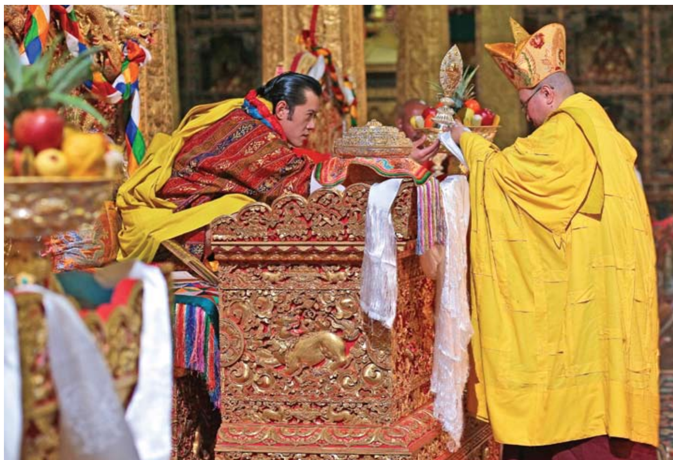
Bhutan's King Jigme Khesar Namgyel Wangchuck is supporting his country's media development with a grant to establish a Media Foundation.

As in evolving democracies elsewhere, journalism is looking to establish its role in Bhutanese society. News media, in particular print, enjoys freedom and tends to critique the government and officialdom. However, in their effort to take a critical position, journalists sometimes